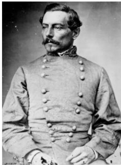
Pierre Gustave Toutant Beauregard (May 28, 1818 - February 20, 1893) Ordered the first shots fired from nearby Fort Johnson onto Fort Sumter April 14th, 1861

BG Micah Jenkins Camp # 1569 4240 Mt Gallant Road Rock Hill, South Carolina 29732