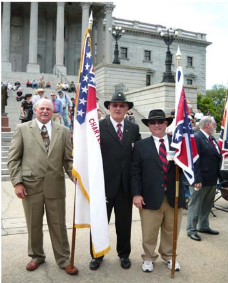
Confederate Memorial Day in Columbia