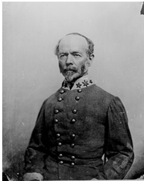
Joseph Eggleston Johnston February 3, 1807 – March 21, 1891

BG Micah Jenkins Camp # 1569 4240 Mt Gallant Road Rock Hill, South Carolina 29732