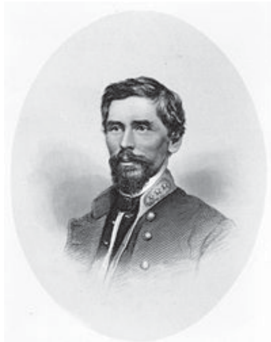
Patrick Ronayne Cleburne March 16, 1828 – November 30, 1864 (aged 36)